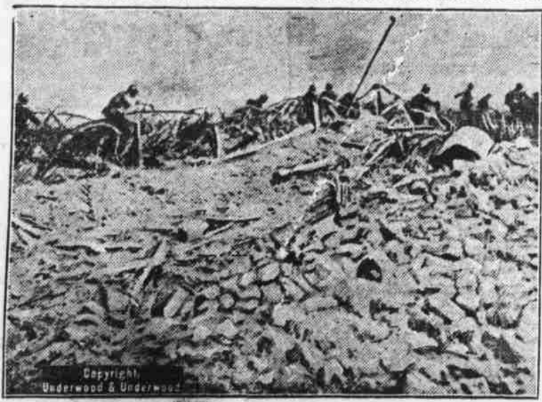
Over the Top in a Charge.