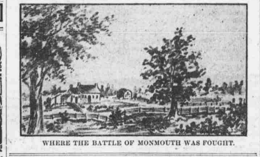
WHERE THE BATTLE OF MONMOUTH WAS FOUGHT.

THE BATTLE OF MONMOUTH. Patriotic Celebration of Its Anniversary in Freehold, N. J. Freehold, N. J., recently appropriately observed the anniversary of the battle of Monmouth. Patriotic citizens from all of the Eastern States, prominent government and New Jersey State officials and troops of militia lent dignity to the celebration. A century and a quarter have passed away since that memorable day when Washington checked the disgraceful retreat of the troops under Maj. Gen. Lee, turning defeat into victory, and brave Molly Pitcher performed the heroic deed which won for her undying fame and enshrined her name in the heart of every American citizen. The battle of Monmouth was the first engagement of importance which the troops under Washington fought after leaving their winter quarters at Valley Forge. The privations and sufferings endured by the American patriots at Valley Forge had well-nigh