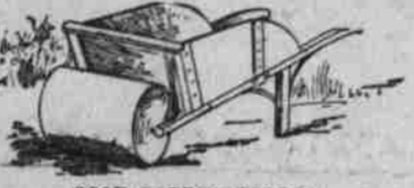
GOOD GARDEN ROLLER.

The illustration herewith shows a handy garden contrivance that can be made in a few moments. A section is sawed from a round log, and its surface smoothed. Two round bits of iron rod are driven into the center of each end, and the roller is ready to take the place of the wheel in the wheelbarrow, the latter being unshipped for this purpose. The special value of this arrangement is that no new frame nor handles are