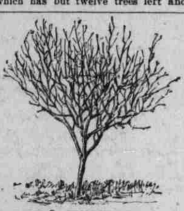
FIG. 2. NEGLECTED TREE.

best—not a representative, but the best tree to be found in the orchard from which it is taken, though the larger (Fig. 1) is more nearly representative than the smaller (Fig. 2). The tenants on five adjoining farms owned by one man, were furnished with a hundred or more trees to the farm. Thus the trees were all planted at the same time, in similar soil, and from the same lot of trees, so that the only difference must come as a direct result of the planting, and after-care received. In the best of these orchards there was no stunting in digging the holes. The roots were carefully spread, and the soil, mixed with stable manure, firmly packed about them. Every winter the ground has been covered with manure taken directly from the stable, a few extra forkfuls being thrown close about each tree, and during the summer the soil has been cultivated in truck and potatoes. These orchards are now seven years old, and in this particular one only several trees have been lost. In spite of the extremely dry summers, though I know of one of the orchards which has but twelve trees left and