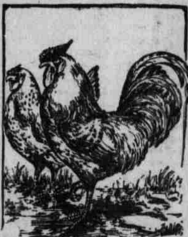
HIGH BRED SILVER SPANGLED HAMBURG separate yards, fed the same and cared for exactly alike. Eggs produced:

Silver Spangled Hamburgs. After twelve years of breeding and carefully testing nearly all breeds of thoroughbred fowls as egg producers, I give my preference to the breed shown here. I have carefully tested them for twelve years and in one experiment they showed their superiority as follows: Ten hens and a cock of Brown Leghorns, Laced Wyandot and Silver Spangled Hamburgs were placed in