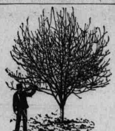
FIG. 1. WELL-CARED-FOR TREE.

Making Orchards Pay. The accompanying illustrations, engraved from photographs taken at the same distance so as to preserve the exact relative proportions of each, tell the whole story of the difference between care and neglect of a young orchard. Each of these trees is the