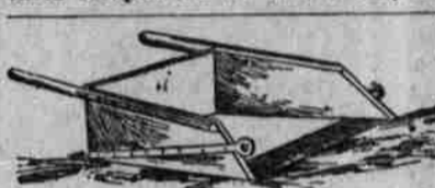
GOOD EARTH SCRAPER.

Homemade Earth Scraper. A good substitute for the expensive earth scrapers on the market may be