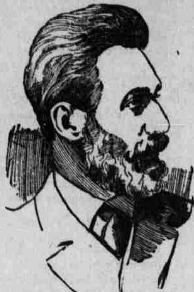
FERDINAND AUGUST BEBEL.

Ferdinand August Bebel, whose fierce attack in the German Parliament upon Emperor William II. on the occasion of the debate relating to the curtailment of the right of free assemblage has caused so much commotion in Germany, shares the leadership of the Socialist-Democratic party in that country with Herr Liebknecht. Bebel is in every sense a self-made man. He was born Feb. 22, 1840, in Cologne, and received his early education in a village school near that city. Later on he attended a grammar school in Wetzlar, and in 1860 he removed to Leipzig, where he established his own business, that of wood-turner and carver, in 1864. Two years prior to that date he had joined in the workmen's movement in Germany, and soon became one of the most aggressive leaders in that cause. From 1865 to 1890, when he removed to Berlin, Bebel was president of the Workmen's Educational Club in Leipzig and member of the perma-