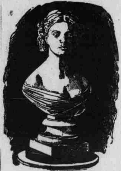
BUST OF QUEEN VICTORIA.

Has a Place Among the Statuary in Osborne Castle. From the beginning of her reign until the death of the prince consort Osborne castle was the favorite retreat of Queen Victoria when she was in search of