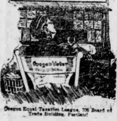
Oregon Equal Taxation League, 706 Board of Trade Building, Portland