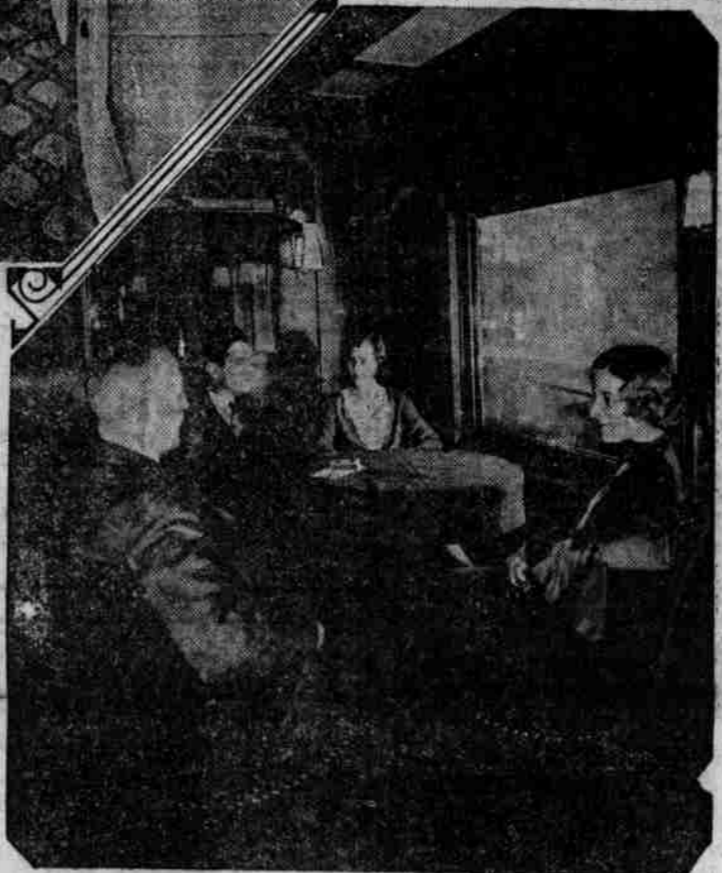
Interior of the artistic and commodious new Pullmans and a corner of the card room in the observation-club car on the new North Coast Limited.

The specially built dining cars were designed specifically for the new North Coast Limited. Observation-club cars of the new trains are radio-equipped.