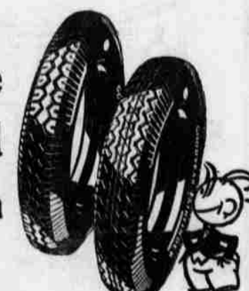
Figure up your costs for punctures, repairs and delays with old tires. The last miles are not economy.

It Costs More to ride on Old Tires Than on New