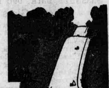
Very seldom are hills as steep as this. The average grade of highway hills is seven per cent. This hill is 25 per cent and a car must be good to make it.