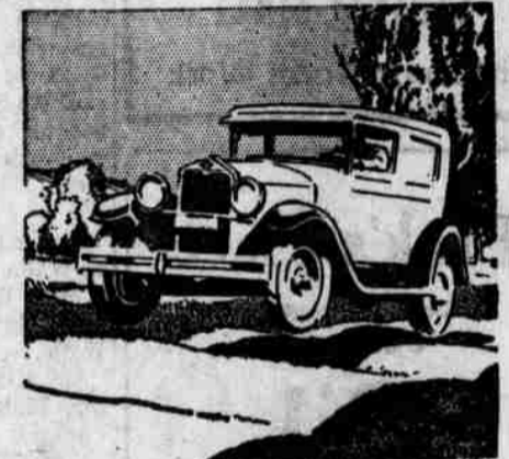
Rough going on a Proving Ground road, made had to test various parts of General Motors cars under hardest possible conditions.

Keep these pictures in your mind. They will come in handy next time you are buying a car.