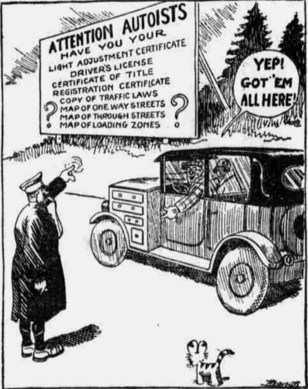
LATEST MODELS SHOULD HAVE A FILING CABINET!

Experimental and Burdensome Automobile Legislation!