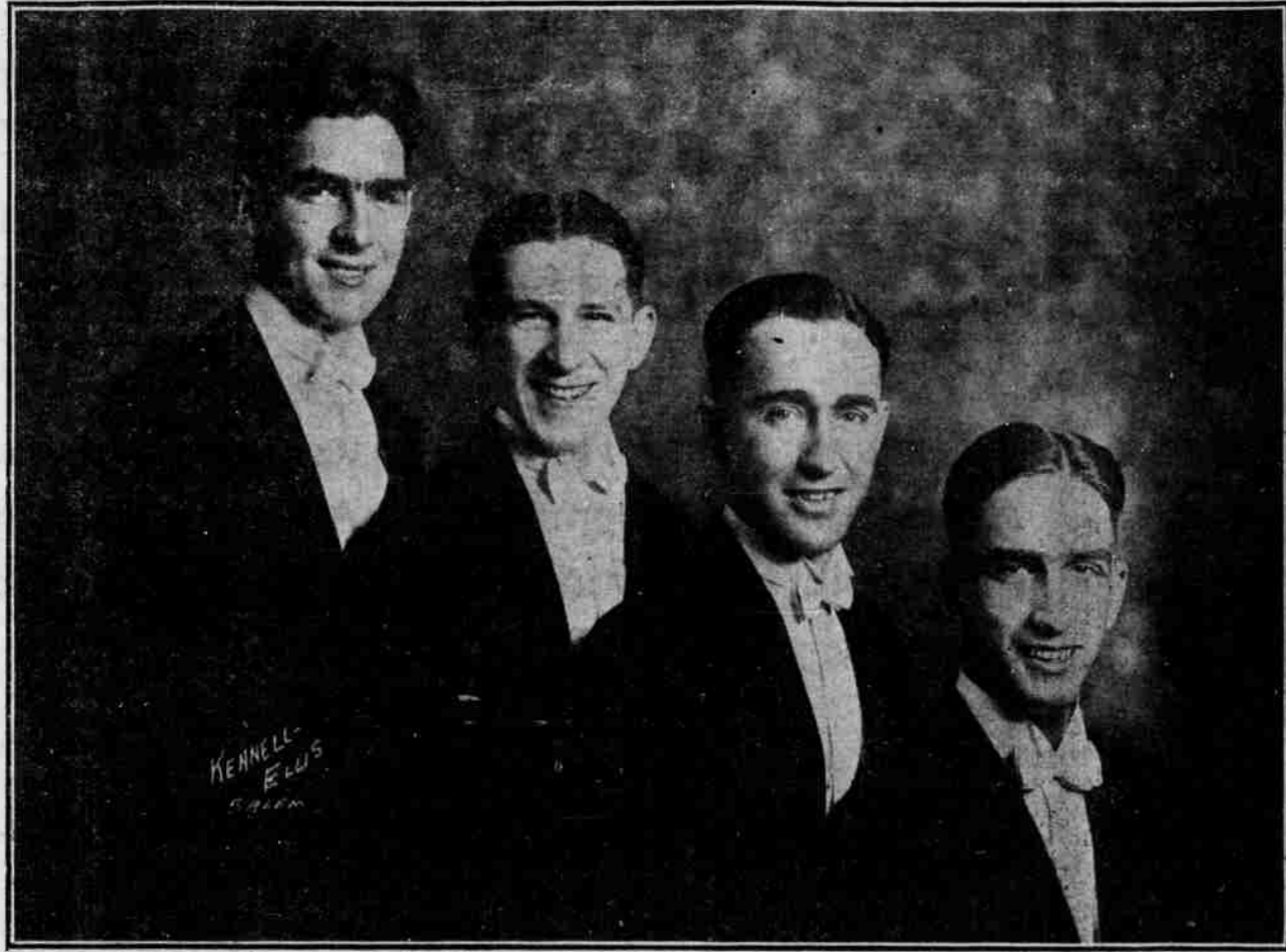
Willamette University Glee Club Quartet, at Auditorium, Tonight