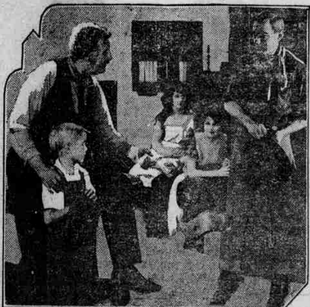
HARRY CAREY in "The Fox" A UNIVERSAL JEWEL

For Lower Prices, Phone 152 5 per cent Discount for Cash.