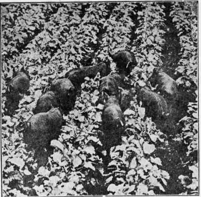
YOUNG PIGS ON RAPE PASTURE

COST OF PRODUCING PORK REDUCED BY USE OF PASTURE AND FORAGE CROPS