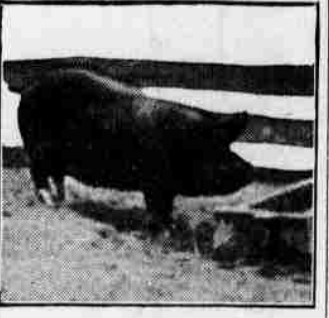
Healthy Pigs Kept Under Sanitary Conditions Are Better Able to Withstand Diseases.

(Prepared by the United States Department of Agriculture.) In the problem of conserving and increasing pork production, it must be remembered that one of the chief factors is the prevention of disease. Swine, particularly young animals, are