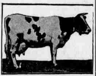
High Producing Cow.

vanced from $18 to $108, or as produc tion trebled income above feed cost increased six times. If no expenses except the cost of feed are considered the cow that produced 450 pounds of butterfat was as profitable as 27 cows of the first group, whose average pro duction was 100 pounds. If labor and miscellaneous expenses also could be taken into consideration the results