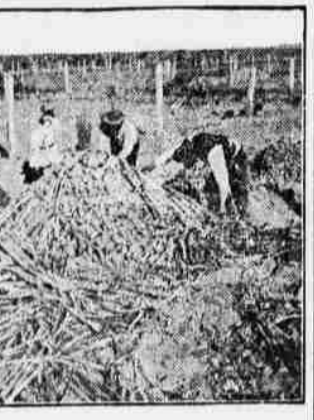
Pit Containing Sweet Potatoes.

(Prepared by the United States Department of Agriculture.) Outdoor banks or pits are used very generally for keeping vegetables. The conical pit is used commonly for such vegetables as potatoes, carrots, beets, turnips, salsify, parsnips, and heads of cabbage and is constructed as follows: A well-drained location should be chosen and the product piled on the surface of the ground; or a shallow excavation may be made of suitable