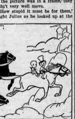
"We're Off," Said the First Goblin.

"A picture," said Daddy, "hung over the mantelpiece of a fireplace in the house where a little boy named Julius lived. "Now, Julius was rather a naughty child. He loved to do all sorts of things to tease People, and he was always getting into trouble. "He did not have as good a time as he might have had, for he was always playing when he should have been studying his lessons. And when it was playtime and all the other boys were to study because he had not known any of his lessons that day. "This happened over and over again. One night Julius was sitting by the fireplace studying. Yes, for a change, he was really learning his lessons. Every day that week he had been kept in school and he had missed all the nice coasting parties and skating and hockey games. "He had really learned all his lessons now, and he was just looking into the fire, feeling very sleepy. It was not quite his bedtime, so, of course, he wouldn't go to bed. "Even if I am sleepy," said Julius, "I'm not going to bed until it is time." "The picture over the mantelpiece was of three large horses. They looked as if they were always going to prance off somewhere, but of course they never did. As they were in a picture, and the picture was in a frame, they couldn't very well move. "How stupid it must be for them," thought Julius as he looked up at the