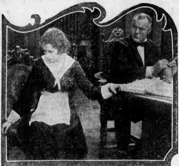
ANITA STEWART in "THE GIRL PHILIPPA"

She was only a will o' the wisp Girl, a bespangled cashier in a cafe on the French-German Border, but she was destined for better things.