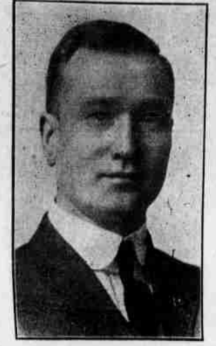
Reputlican Caudidate for Nomigation as District Attorney. My platform: "To Do My Duty."