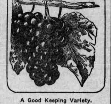
A Good Keeping Variety.

What a pity it is that grapes will not keep longer. Every autumn I place in a department of my house cellar, where there is no artificial heat, baskets of various varieties of grapes, says a writer in Green's Fruit Grower. I do not expect the Worden, Concord, Delaware and Niagara to keep long, therefore I consume them first. After these I consume the Brighton, which is a fairly good keeper, but which shrivels up considerably. Barry has kept well with me this season. Gaertner, a red grape, has kept pretty up to Thanksgiving.