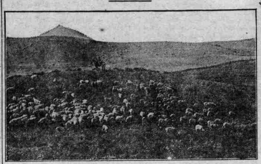
Sheep on a Western Ranch.

One of Daintiest of Animals Will Live and Grow Fat Where Cow Would Starve to Death-Aim to Have Lambs Come in January or February, the Earlier the Better.