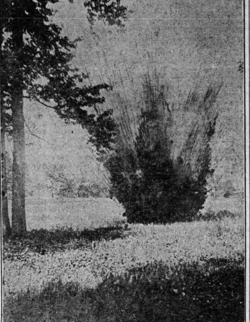
An Explosion of Dynamite.

By Use of Explosive Farmer Is Enabled to Blow Out Boulders and Stumps; Drain Marsh Land and Improve Soil by Making It Porous—Trees Make Rapid Growth.