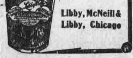
Libby, McNeill & Libby, Chicago

Just try a package of any of these, such as Ox Tongue, Vienna Sausage, Pickles, Olives, etc., and see how delightfully different they are from others you have eaten.