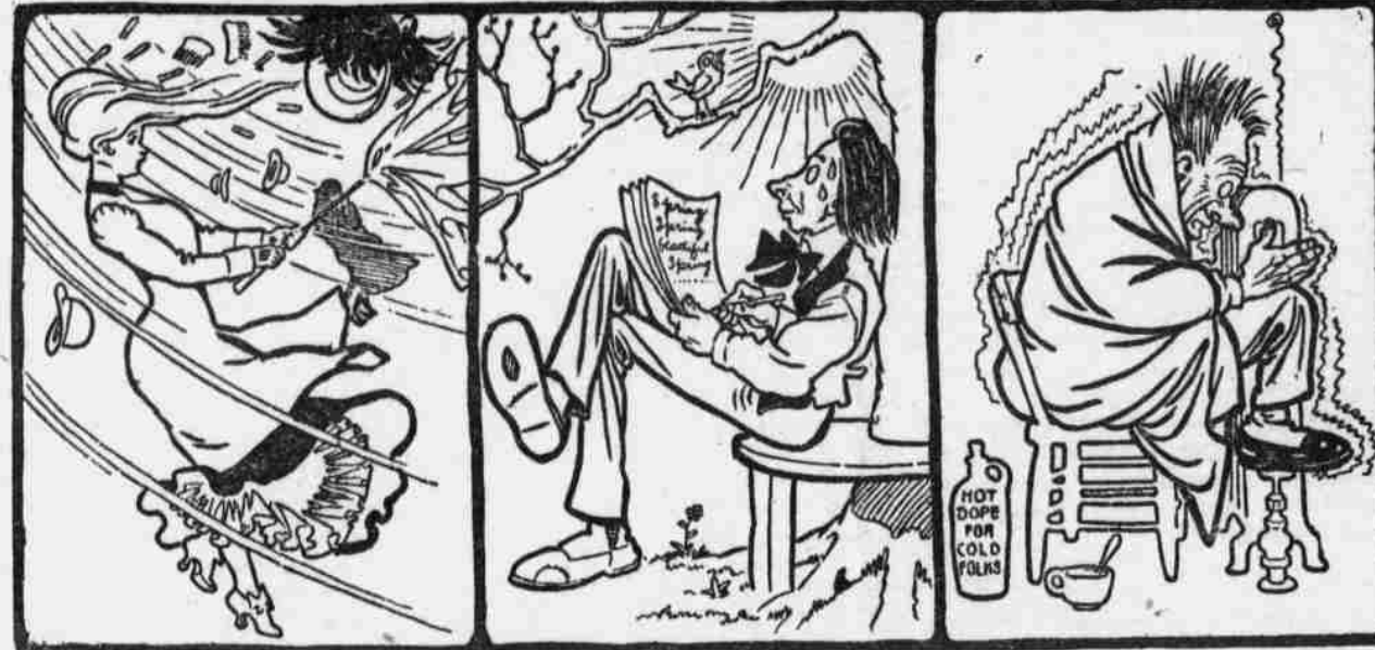
Rain and Warmer.