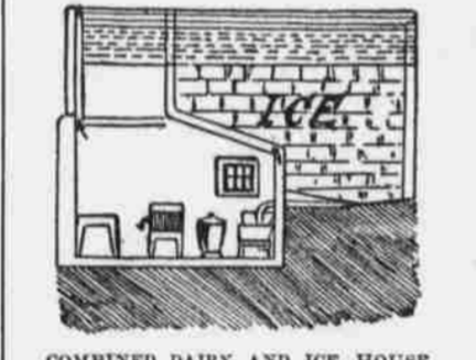
COMBINED DAIRY AND ICE HOUSE.

After a "season" of cutting ice, the two ice-men proceed to lift out and load up. One seizes the tongs and catches onto the floating cakes, while the other man presides at the rope, D. The sleigh should be in the handiest position to swing the sweep around and land the cake of ice into the box. The combination style of ice-house represented in the illustration is not the best for all purposes, yet has some features to recommend it. The sides of the building are nine feet above the ground and the height of the dairy seven feet. The outside walls of the ice-house are made of two-inch planks, ten inches wide, set upright, with inch and a half planks nailed on the outside. They are weather boarded on the outside and filled with spent tan bark or other dry non-conducting material. The partition wall between the dairy and the ice-house and between the cool room and the ice-house is half the thickness, and not filled, thus forming closed air spaces between the studs.—Montreal Star.