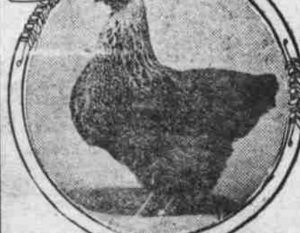
SILVER WYANDOTTE HEN

turkeys and ducks, homing pigeons with records as victorious racers over distances ranging from 100 to 1,000 miles, and pheasants such as English noblemen shoot, bred on the large pheasant farm in the country five miles from Chicago, were attractive. Baby chicks were hatched out in incubators every day of the show. Resents "Tainted Money" Hint. In his recent address at the annual dinner of the New York Alumni Association of Syracuse University, John D. Archbold, the Standard Oil magnate, took occasion to refer to "tainted money" by saying: "If I thought there was any taint on my money I would never have offered a dollar of it to Syracuse University—my conscience would not have allowed me. I could not have asked God's blessing on such a gift. I have earned my money by fifty years of good, hard, conscientious toil, and honest intent in the pursuit of business, or I would never have given a dollar to further God's work."