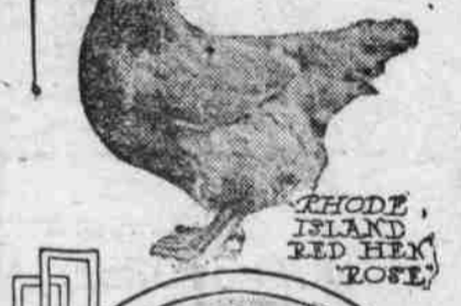
RHODE ISLAND RED HEN