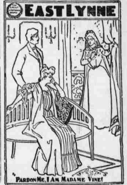
A Superb Revival of this