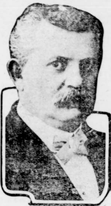
THOS. F. RYAN

Governor General of Belgium on Record as Declaring the Innocent Must Suffer With the Guilty—Irvine Cobb's Tale of Horrors.