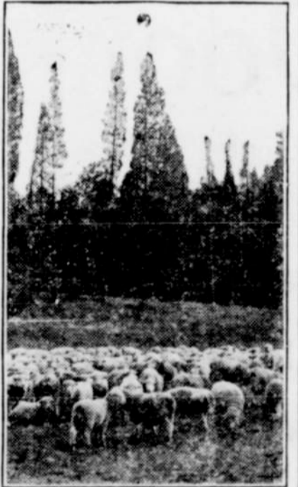
SHEEP GRAZING ON NATIONAL FOREST.

In 1914 it was estimated that no more than 30 per cent of the new settlers had more live stock than was necessary to supply them with work and milk animals. The situation in this respect, however, was changing even then, and the movement for the production of more live stock may be expected to continue because both market and agricultural conditions make this indispensable to really successful farming. The change will be gradual, it is said, and only a few head of stock will be added to a farm.