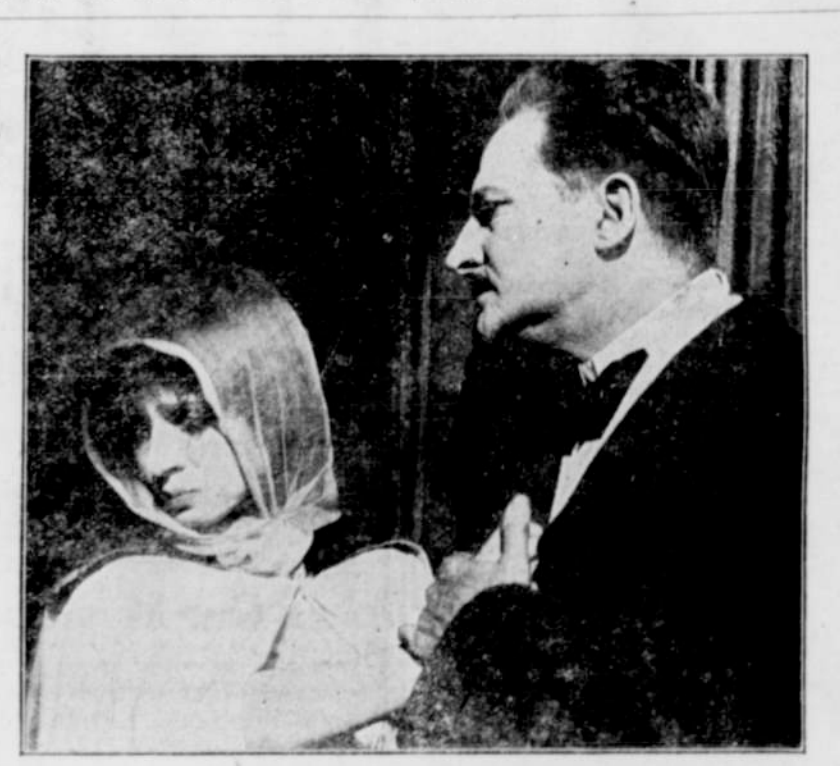
Scene From "Wormwood"-A Fex Feature at the Grand Theatre Friday, December 17th.

A ferry, the only means of crossing the lower Coquille river, is losettlements in Coos county. Each year thousands of people cross the river here going to and from Ban-Nestling in among the hills which don and Marshfield and the rich sec-