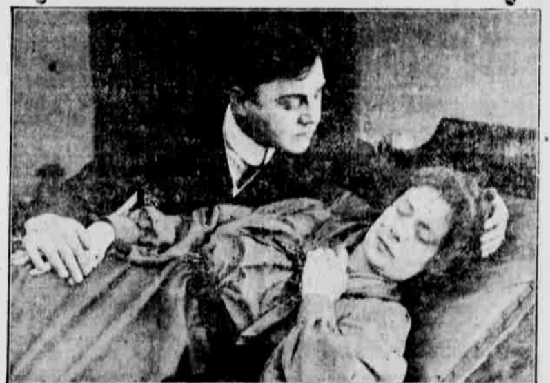
Three Noted Stars Appear Together in Tolstoy's "A Woman's Resurrection."