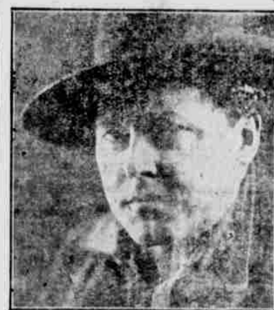
William Farnum $100,000.00 Star in "The Plunderer"