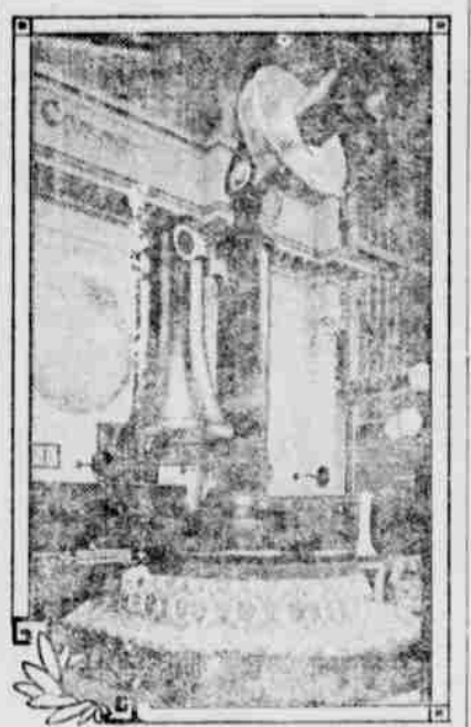
TELEPHONE TWENTY-TWO FEET HIGH AT THE PANAMA-PACIFIC EXPOSITION. This giant telephone is shown in the Palace of Liberal Arts, Panama-Pacific International Exposition, San Francisco.

one of many revolutionary scientific advances demonstrated at the Exposition. The invention has made possible the transcontinental telephone, and the principle which is applied has not been developed to its fullest extent. It is said that with the probable develop-