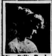
Miss Billie Burke