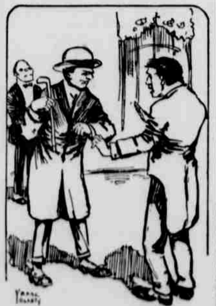
THE PROPRIETOR STOPPED HIM.

Waiting until next day, a man went in and had dinner enough for two. As he was leaving without paying, the