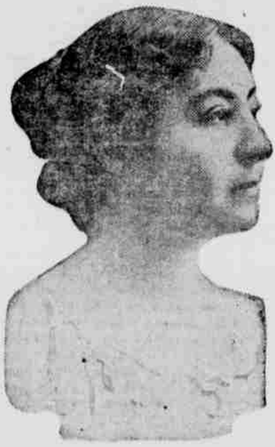
NATALIE, EX-QUEEN OF SERVIA.