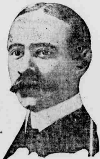
DR. PAUL REINSCH

Berlin.—Ex-Queen Natalie of Servia has decided to forgive and forget her tragic history in the country where her unhappy married life was passed and where her son, King Alexander, and his spouse were assassinated. She has turned over 27,000 acres to the Belgrade university, a valuable collection of arms made by King Milan and King