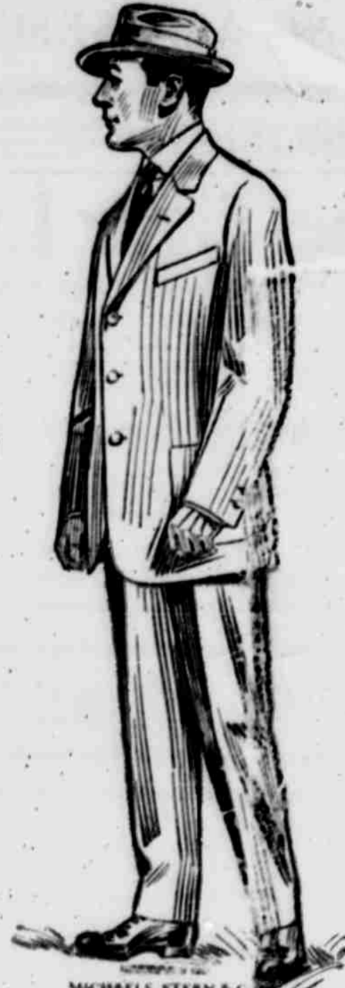
MICHAELS, STERN & CO. BOSTON, N. Y.