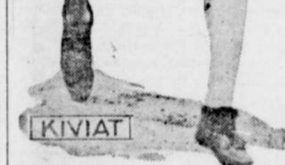
TWO SPEED BOYS WHO ARE GOING AFTER NEW RECORDS.

Taking everything into consideration, the coming outdoor season bids fair to be the greatest year in athletics.