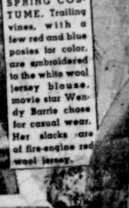
SPRING COSTUME. Trailing vines, with a few red and blue posies for color, are embroidered to the white wool jersey blouse. Her slacks are of fire-engine red wool jersey.