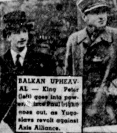
BALKAN UPHEAVEL—King Peter (left) goes into power. Late Paul (right) goes out, as Yugoslavs revolt against Axis Alliance.