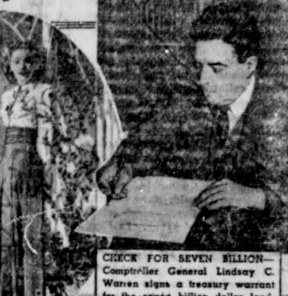
CHECK FOR SEVEN BILLION—Comptroller General Lindsay C. Warren signs a treasury warrant for the seven billion dollar lend-lease fund voted by Congress, the largest single warrant in history.