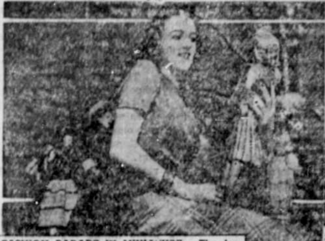
FASHION PARADE IN MINIATURE—The forward march of fashion during 50 years is symbolized by these dolls, each "modeling" a decade's styles. They are a feature of the Fisher Body display in the General Motors Parade of Progress, traveling exhibit which spotlights our progress in everything from cars to clothes.