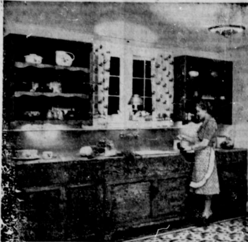
Shadowless Illumination Lightens Tasks in Woman's Workshop.