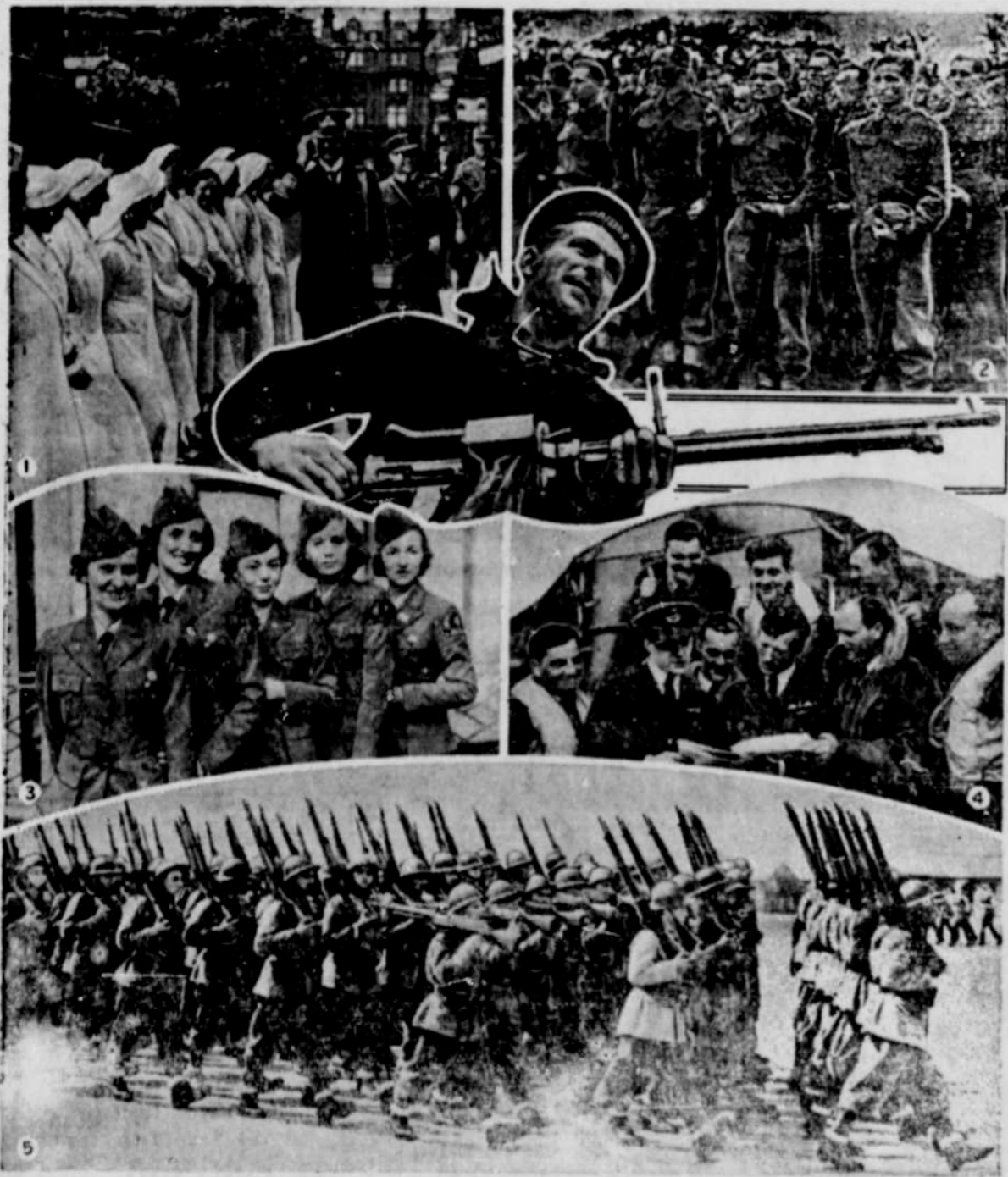
BRITAIN, struggling tenaciously against aggression in its battle for freedom, does not fight alone. Beside the soldiers of the British Commonwealth, fight the armies of the occupied but unconquered sectors of Europe, united in one common cause: their right to freedom. The photos show: 1—King Haakon in London, reviewing members of the Norwegian Nursing Service, who are on night duty during the bombing raids. 2—"Somewhere in Scotland," soldiers of the Polish Army who escaped from one country to another after invasion of their own, seek their ally, France to Poland. 3—American girls living in England who are helping the British war effort. 4—Green flying foxes, a new type of aircraft, are being developed in England.