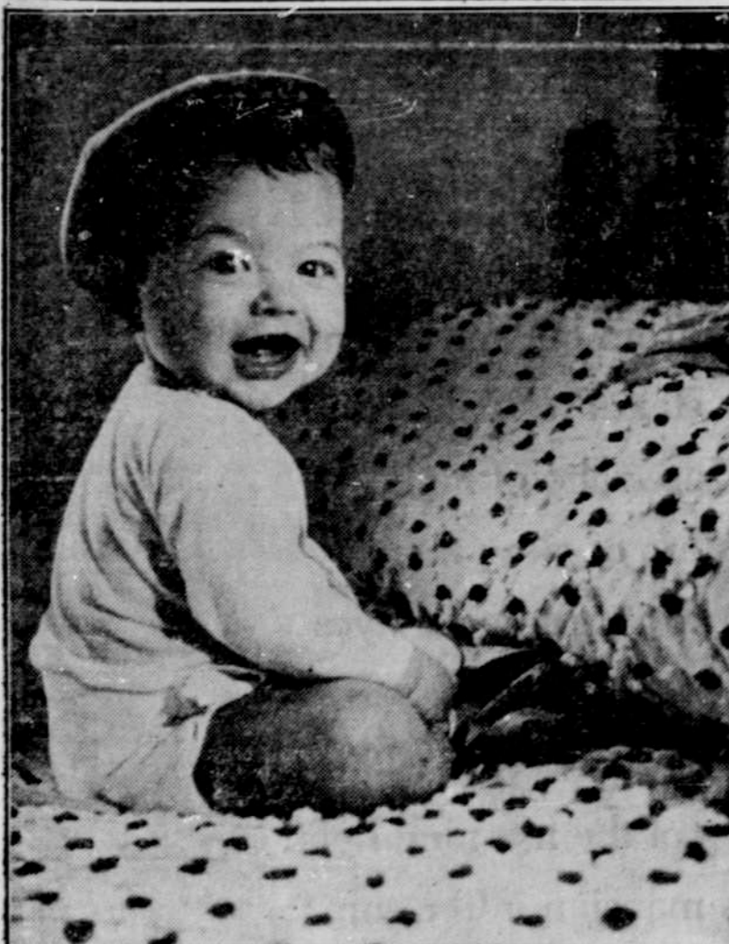
Good expression is the important point in baby shots. Watch for them-- and let your subject be his natural self.

IT'S easy enough to get good baby pictures--if you go at it the right way. The secret of the whole matter is to pick your subject when he's in a good mood--and just let him be natural. Give him a toy--something bright, something that's colorful and maybe new to him, and he'll provide the expressions you want.