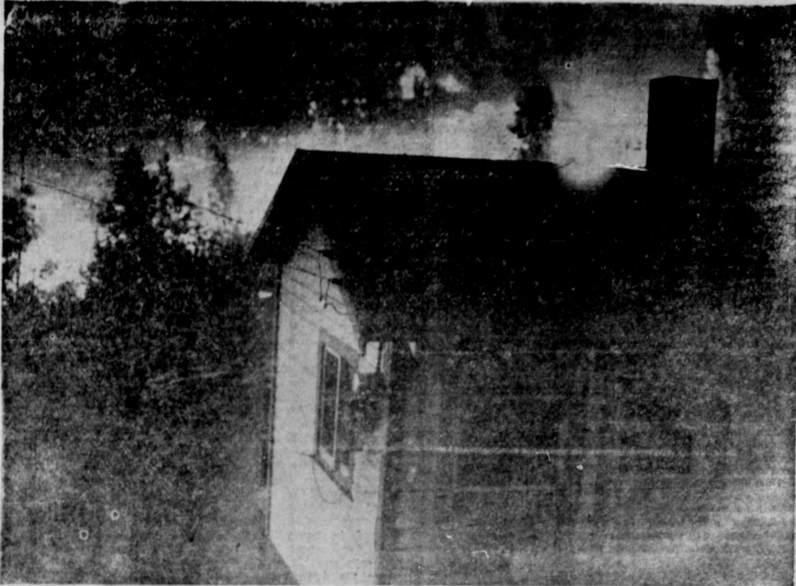
PORTLAND Fire licking at dry underbrush on the West Hills threatened the home of Oliver Armstrong, on Bonny Slope. Like scores of neighbors, Armstrong used a limited supply of water in a lone fight to keep sparks from igniting his roof and to hold the flames from roaring through the tinder-like grass and firing his house.