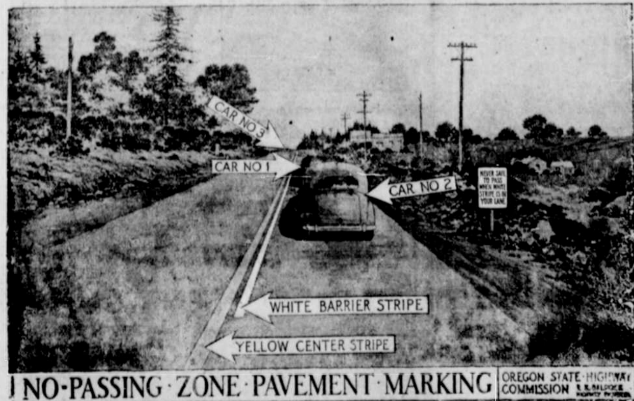
In the artist's sketch, car No. 2 has overtaken car No. 1 but the driver of car No. 2 is warned by the white barrier stripe that it is not safe to pass No. 1 without danger of colliding with car No. 3, which, for purposes of illustration may barely be discerned approaching over the crest of the hill.

(Serves 6-8) 3 cups orange juice, strained 1 pound (about 60) marshmallows, quartered Heat in top of double boiler until marshmallows are melted. Do not