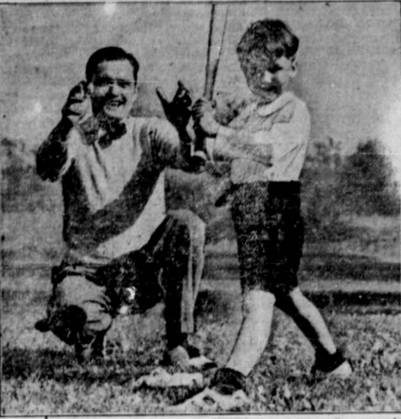
Excellent likenesses, and a "story idea," make this picture a fine example of a good informal portrait snapshot.

EVERY family album or picture collection should include good informal portraits of the family's members. But many amateur photographers do not know how to take informal portraits, or realize how these differ from other popular types of pictures.