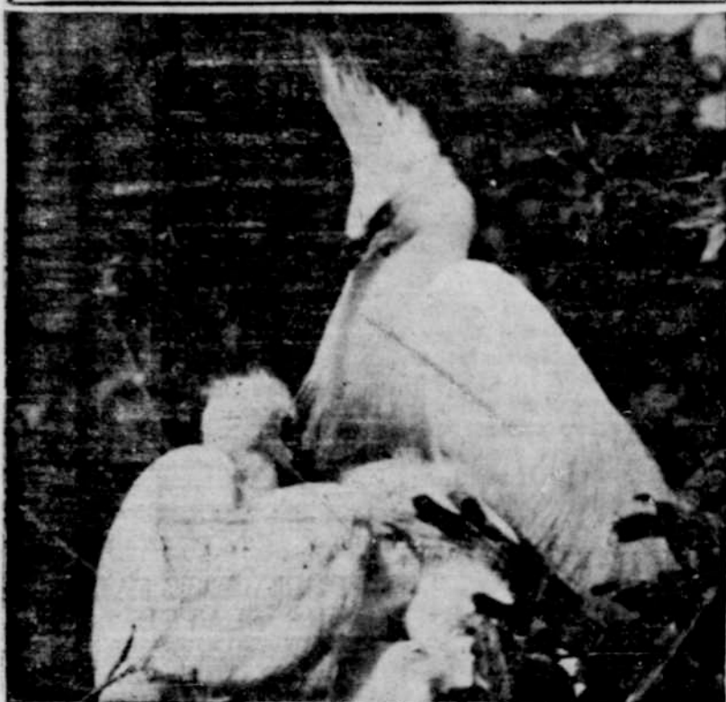
By RICHARD S. BOND

You travelers who this year are seeking wonders at home will find them in abundance. Follow this series and map your tour to cover as many "Wonder Spots" as possible. Your vacation never will be forgotten. Be sure to see the snowy Egrets of Jungle Gardens, Avery Island, Louisiana. One hundred and thirty thousand of these gorgeous birds may be viewed from April to July — leaving their young each morning to feed in distant streams, and returning in a billowy white cloud at night to where they are nesting in bamboo "apartment houses" or some water growing tree. These famous gardens are filled with wonders from the four corners of the earth. Flowers of all kinds abound; bamboo that grows eighteen inches in a day; papyrus from the Nile; the Sacred Wasil orange tree and tunnels of wisteria vines. The gardens cover 300 acres — every inch a delight. But upon many, the snowy Egrets make the most lasting impression. There is an interesting story behind the fact that 150,000 Egrets now display themselves to a touring public in one little bird city. Less than fifty years ago the Egret was almost extinct. Craving for plumage for milady's hat was the cause.