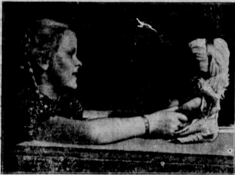
Here, all the light comes from the right. Try different lighting effects with a subject such as this. Use the diagrams below as guides in placing your photo lights.

HALF the fun of taking snapshots at night is in working out novel lighting effects. You don't need a lot of lighting equipment, either. Two photo bulbs in cardboard reflectors, and a light-toned wall for a background—these enable you to evolve numerous interesting lightings that add value to your pictures. The diagrams below show how you change the position of your camera to obtain different effects. S stands for subject, C for camera, and B for background. The number 1 indicates a No. 1 photo bulb in cardboard reflector, and 2 indicates a No. 2 bulb. These two bulbs, when in reflectors, are sufficient for box-camera snapshots on high speed film. At left, first row, is the regular 45-degree lighting. Center, a more