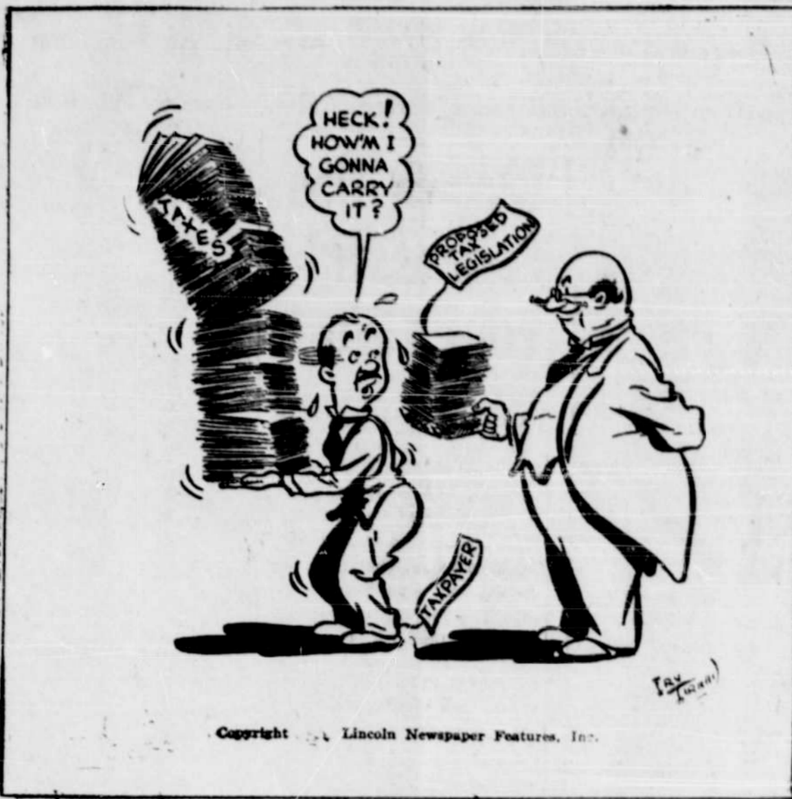
Copyright © Lincoln Newspaper Features, Inc.