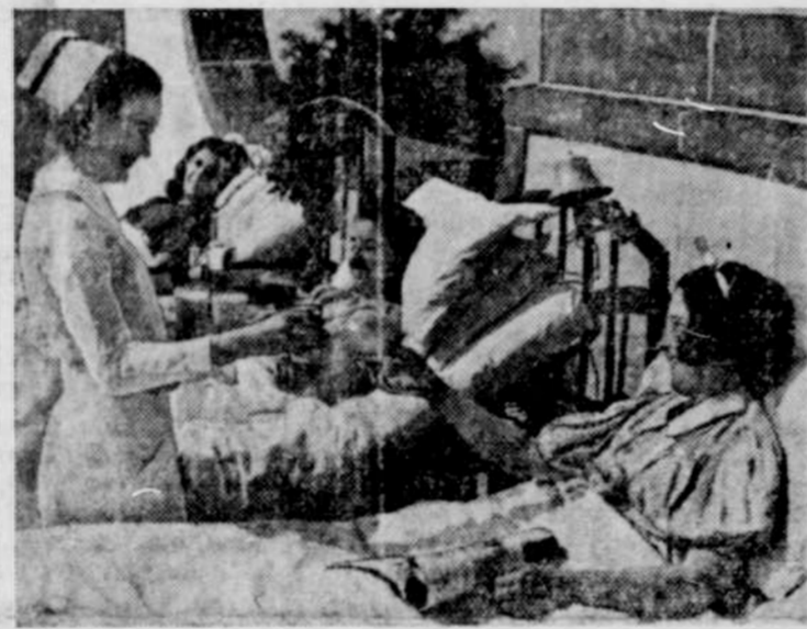
Three young patients recovering from tuberculosis receiving their afternoon refreshment. Complete rest in a sanatorium is the Number One requirement in curing from this disease. Christmas Seals are enabling tuberculosis associations to assist in finding people ill with this disease and in starting them on the road back to health.