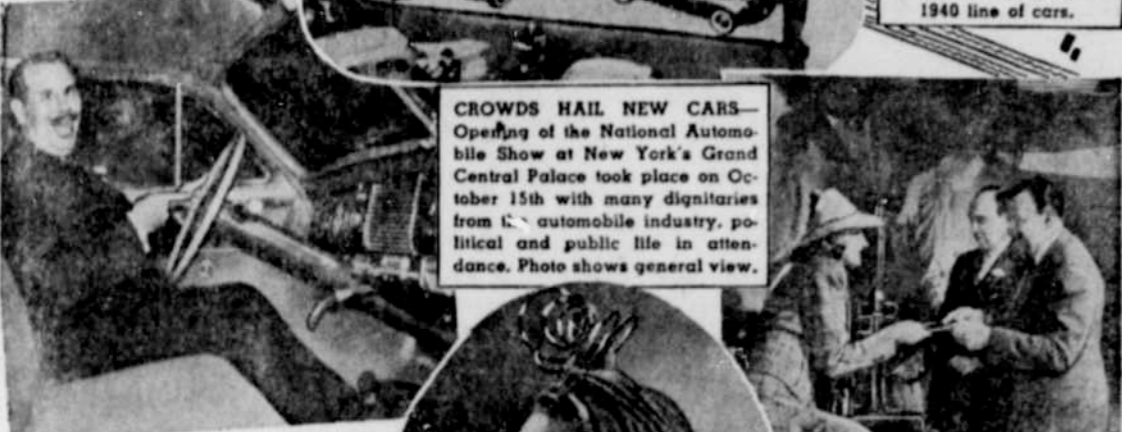
CROWDS HAIL NEW CARS —Opening of the National Automobile Show at New York's Grand Central Palace took place on October 15th with many dignitaries from the automobile industry, political and public life in attendance. Photo shows general view.