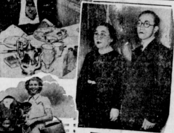
JAPAN'S GREATEST WOMAN doctor, Mrs. Yayoi Yoshioka and her son Hiroo as they arrived in New York recently from Europe. Mrs. Yoshioka, an ardent admirer of American scientific methods, heads the Woman's Medical College of Tokyo.