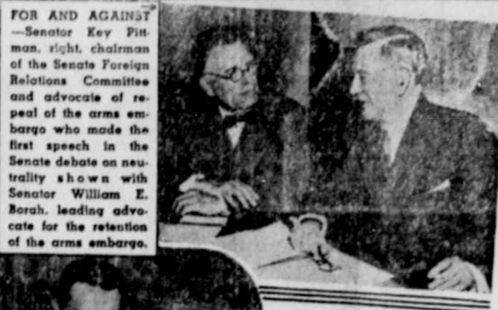
FOR AND AGAINST —Senator Key Pittman, right, chairman of the Senate Foreign Relations Committee and advocate of repeal of the arms embargo who made the first speech in the Senate debate on neutrality shown with Senator William E. Borah, leading advocate of the arms embargo.